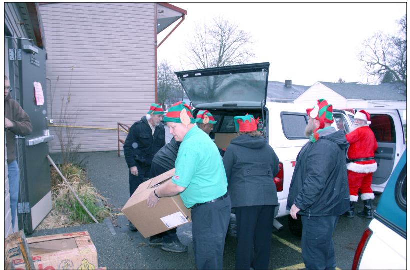
JBLM elves unload gifts