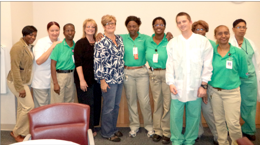
PCSI Winn team

With only three "minors," the PCSI team at Tinker AFB is doing majorly amazing work! PCSI employs 60 people at Tinker to maintain a fleet of over 800 motor vehicles on base. When last evaluated in November, Air Force inspectors found only three minor discrepancies in contract performance. This achievement is remarkable in light of the fact that Team Tinker (as they call themselves) must comply with thousands of regulations, orders, and procedures. According to Program Manager, Vicki Hoppes, "We made ourselves and our customer shine!"