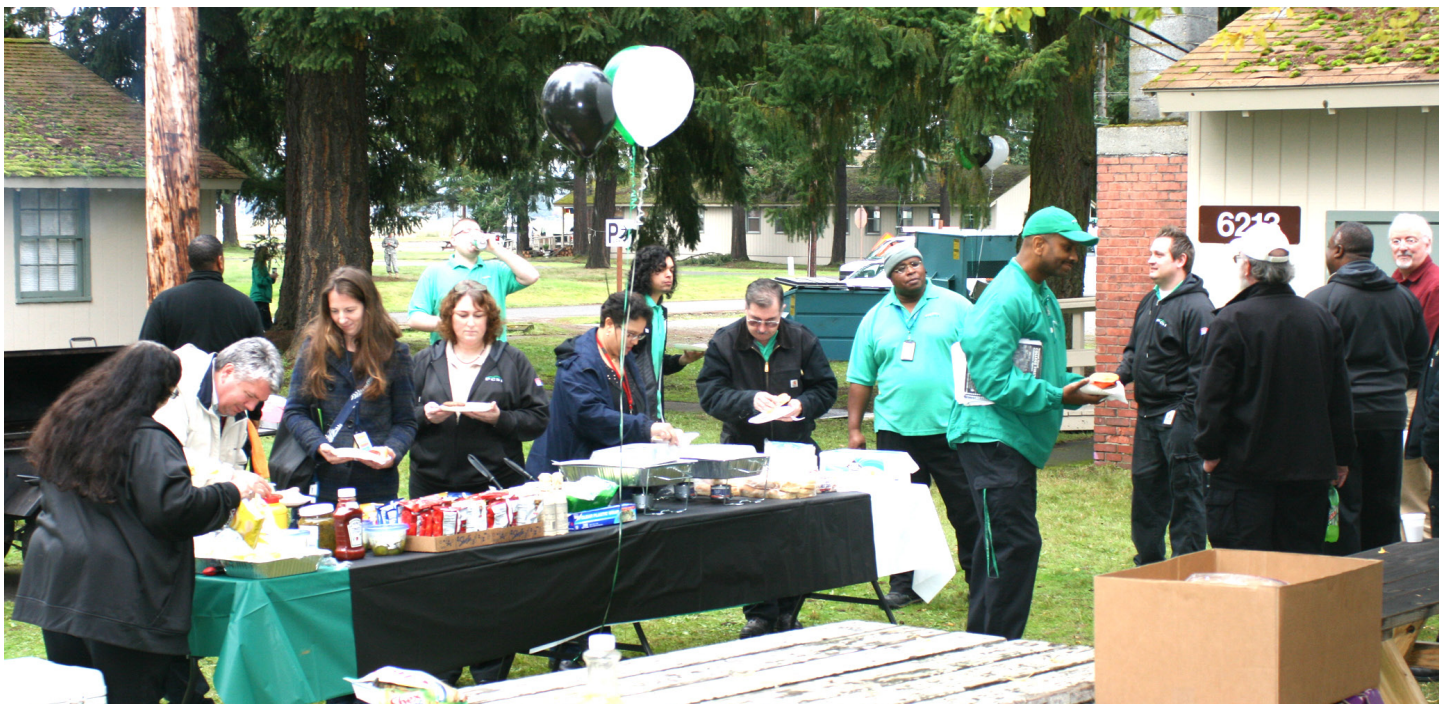
JBLM celebrates NDEAM with barbeque and open house