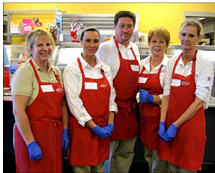
Soup kitchen volunteers

planned to collect food and personal items for victims of the historic September floods. However, the government shutdown in October made it impossible to hold a donation drive at the Army hospital that month.