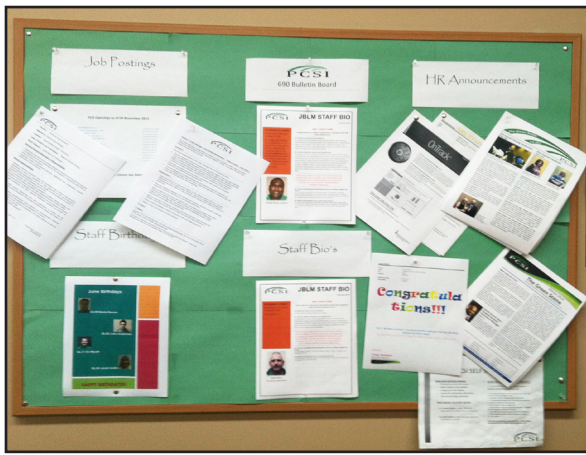
JBLM Biography Bulletin Board