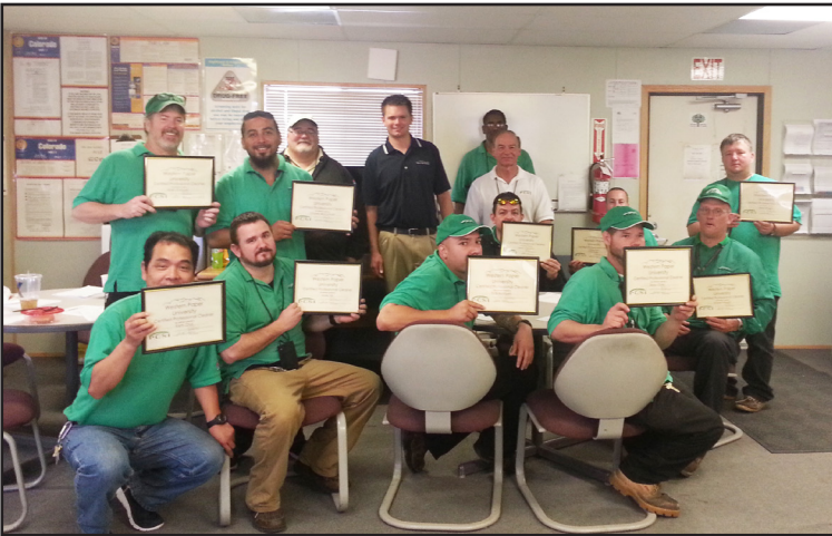
Schriever janitors display certificates