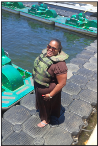
Paddle boats on LETRA at Fort Sill