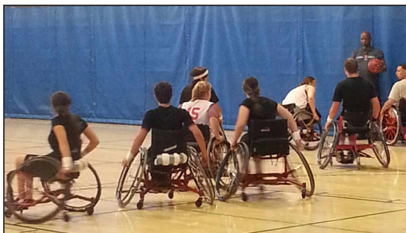
Wheelchair Basketball at UCO Endeavor Games

Many thanks and congratulations to all for investing so many resources—time and money—to EMPOWER people with disabilities to realize their potential as competitive athletes!