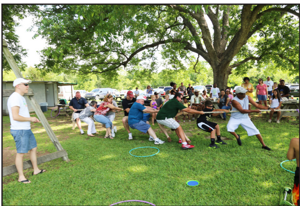
Corporate employees play tug-of-war

On Saturday, June 14, about 90 Fort Sill folk (employees and family) picnicked at Lake Elmer Thomas Recreation Area (LETRA) on Fort Sill. On the water, they enjoyed paddle boating, canoeing, and fishing. On the land, they played miniature golf, volleyball, and horseshoes. Two bounce houses were rented for the kids. In addition, the LETRA swimming pool with water slide was open to visitors. Fort Sill managers and their spouses prepared lunch for the employees: hamburgers, hot dogs, hotlinks, bratwurst, baked beans, potato salad, coleslaw, chips, cookies, and drinks. Yum!