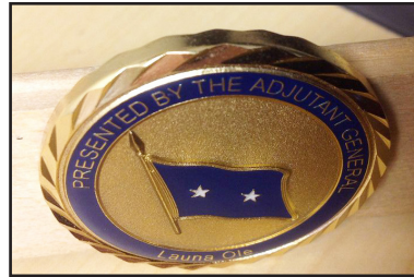
General's coin says "beyond compare."