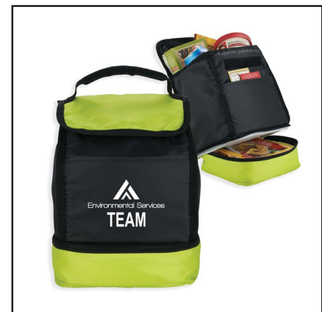
EVS lunch bags for IACH team

Two weeks after the start of PCSI's new EVS contract at RACH, staff celebrated EVS Week with a pizza party dinner. The team of 33, including incumbent employees and new hires, enjoyed getting to know each other, lots of laughter, and no talk about work.