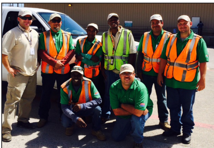
Grounds maintenance crew members

More details to follow in the fall issue of The Green Scene.