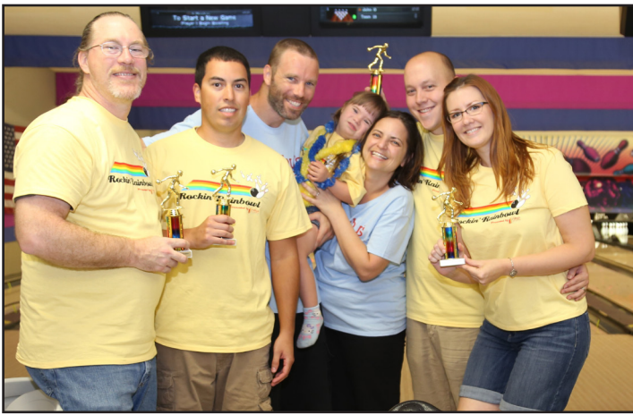
PCSI bowling team with Ruby's Rainbow founders