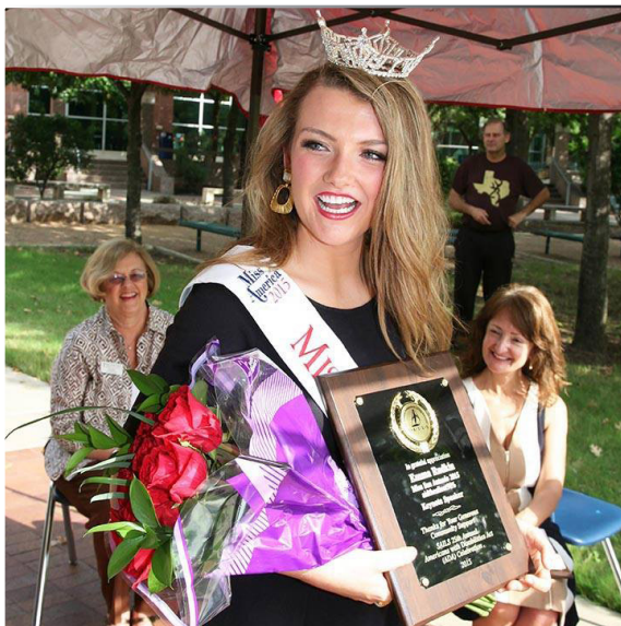
Miss San Antonio, SAILS keynote speaker