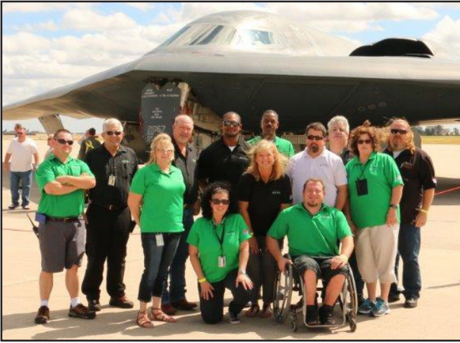
Team Tinker members on flight line with B-2