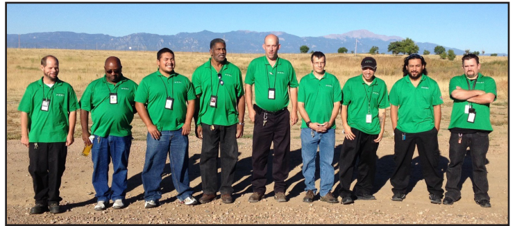
PCSI janitors at Schriever