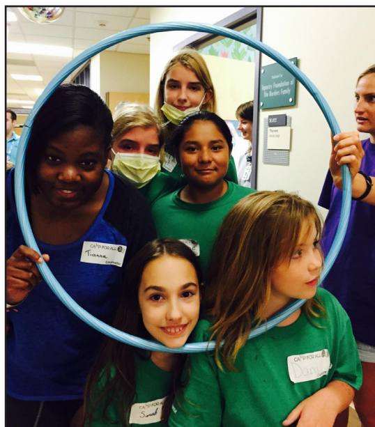
Camp For All 2U participants