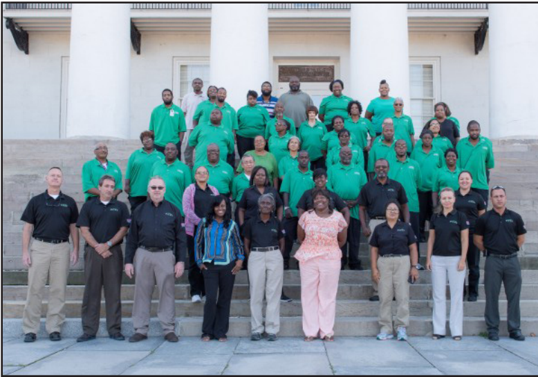
NMCP EVS team