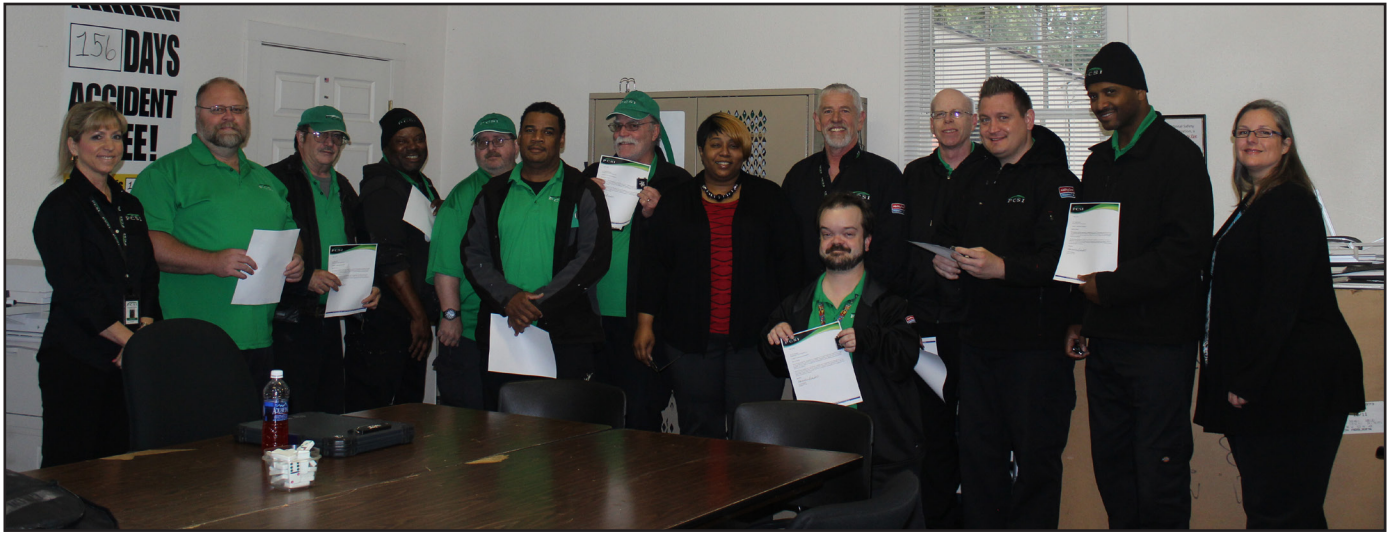
First five-year anniversary celebrants