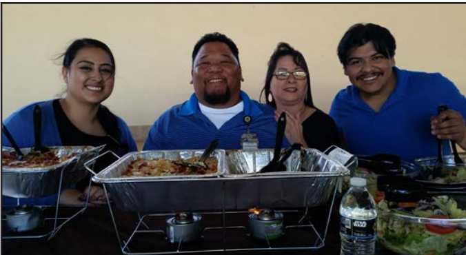
Managers serving lunch