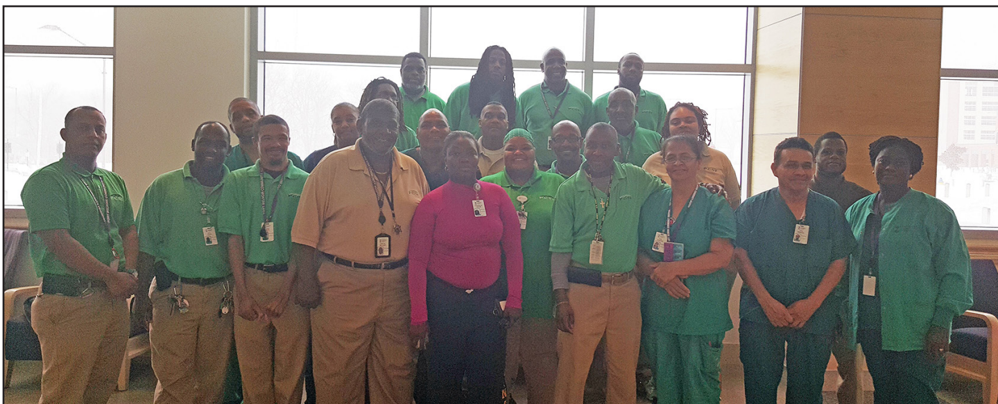
PCSI staff who sheltered in place