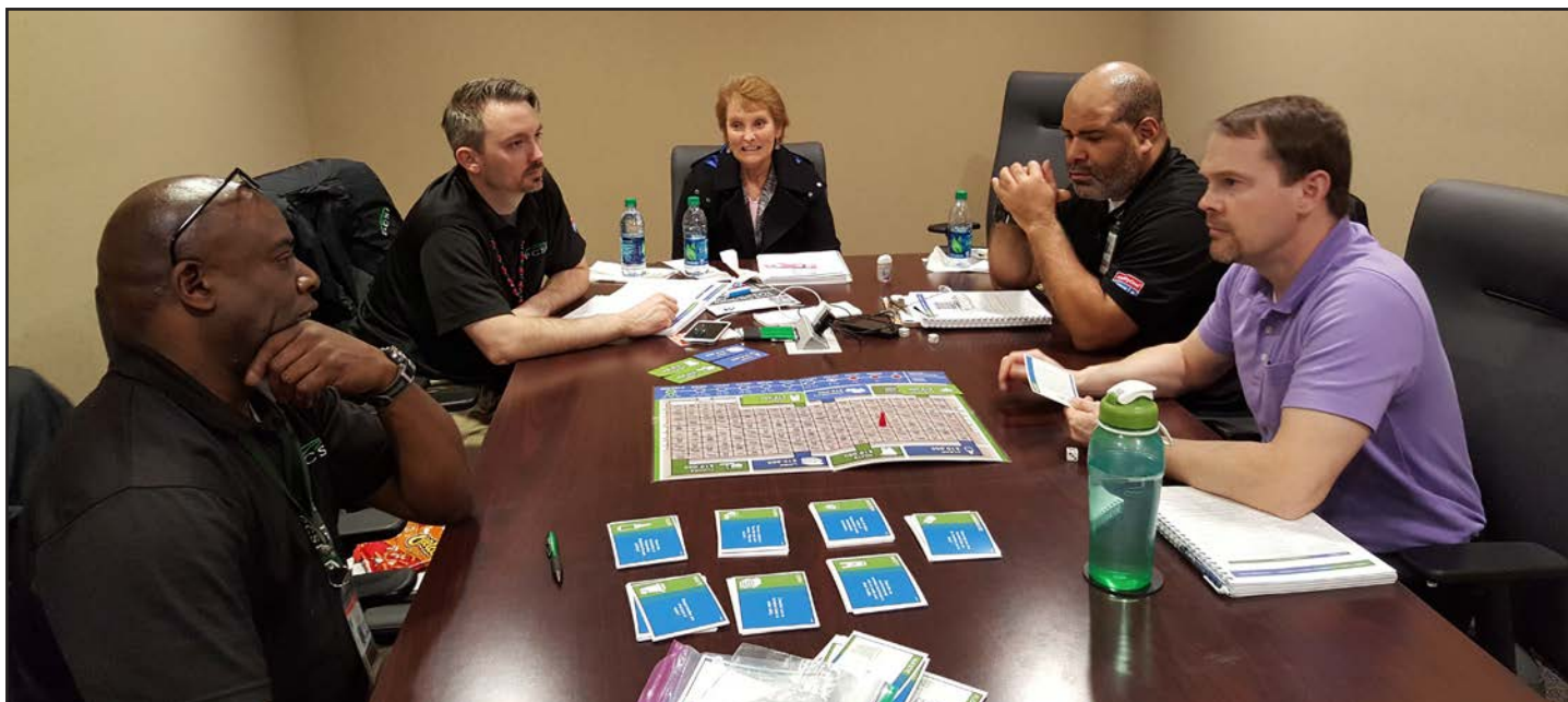
Studying for CHEST at IACH