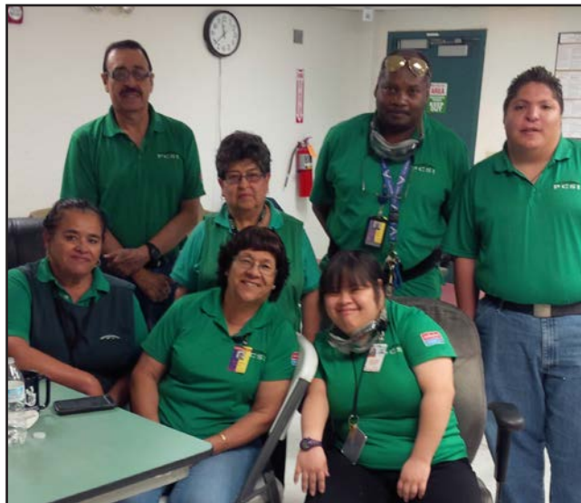
EPIA Janitorial Team