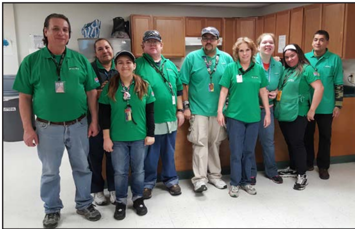
EPIA Janitorial Team

PCSI has served EPIA since 1998. Today, 35 dedicated employees keep the airport restrooms clean and comfortable for travelers.