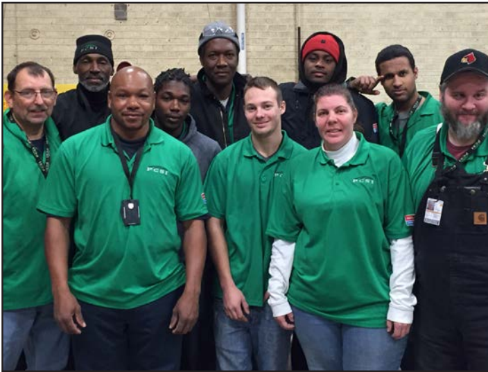
DTA Roads & Grounds team