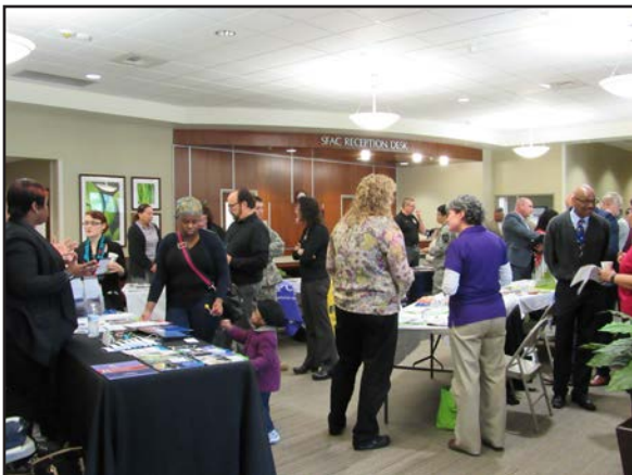
Busy SFAC Education Fair