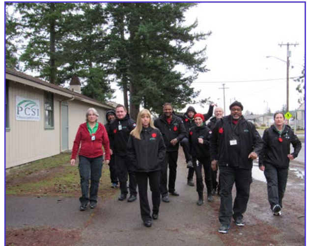
Walking for heart health