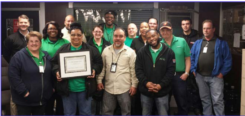
RSO Oceana team