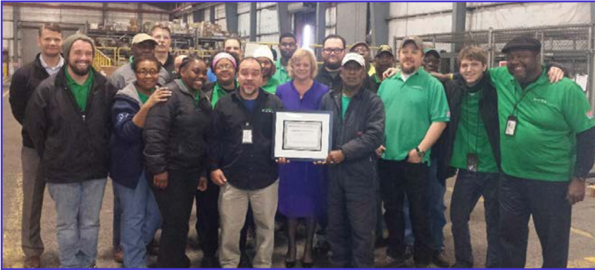
RSO Norfolk team