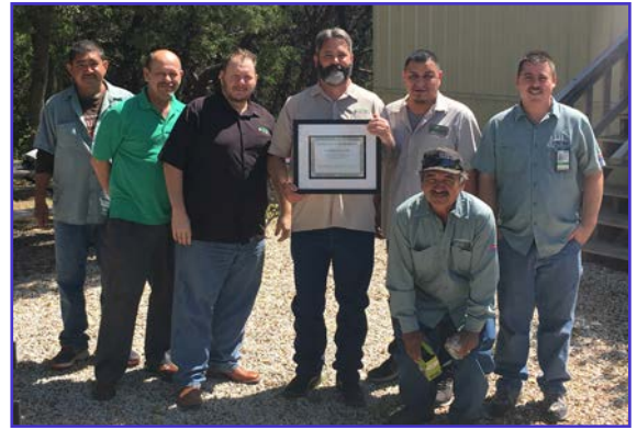
Camp Bullis team

Congratulations to the anniversary celebrants! Who will be next?