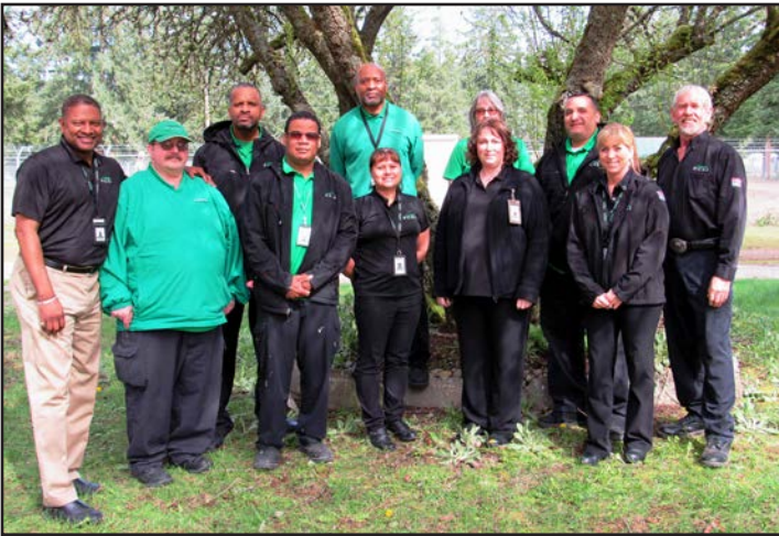
JBLM volunteers for DOM