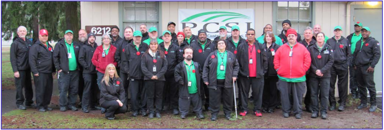
Team JBLM wears red