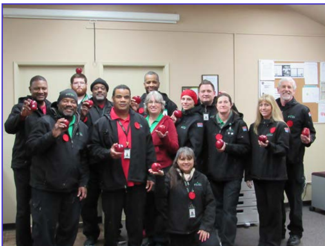
Apples to snack after walk