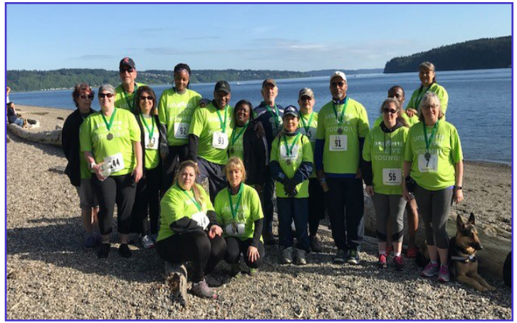
Team PCSI-JBLM wearing commemorative medals

According to Smith, race day was sunny and bright like the spirit of volunteerism and community service at Team PCSI-JBLM.