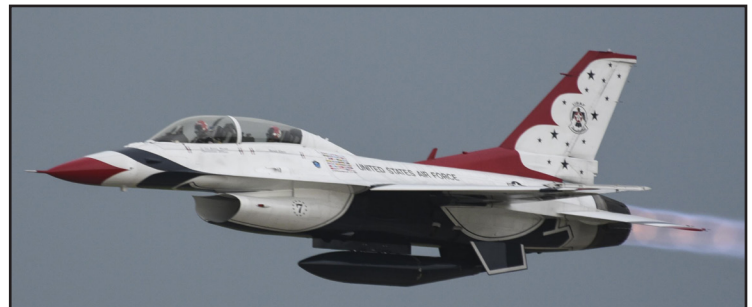
Thunderbirds F-16D