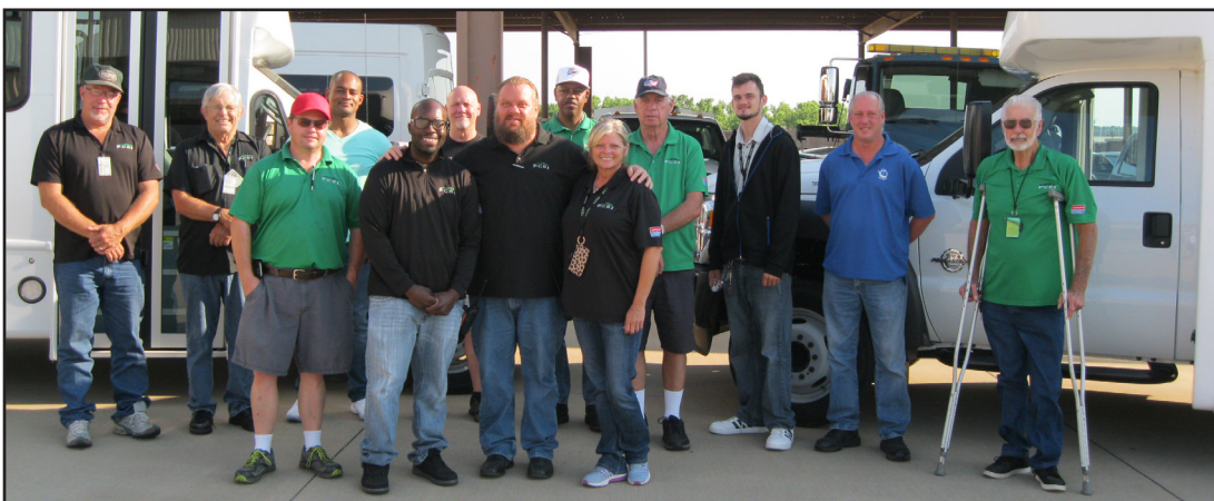
Team Tinker members