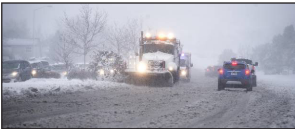
March 24