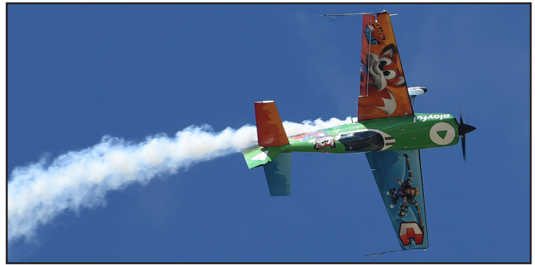
Aerobatics