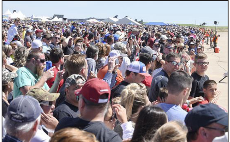
Crowd watches