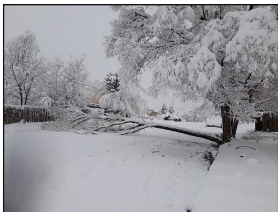
April 4