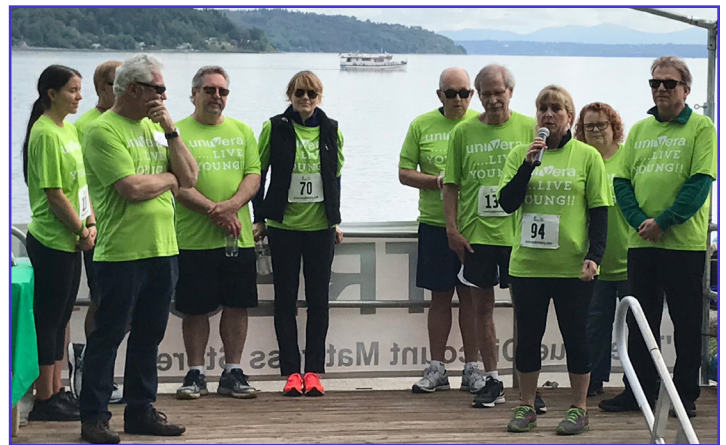
Smith at mic addresses crowd