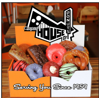
Treats for an exceptional team