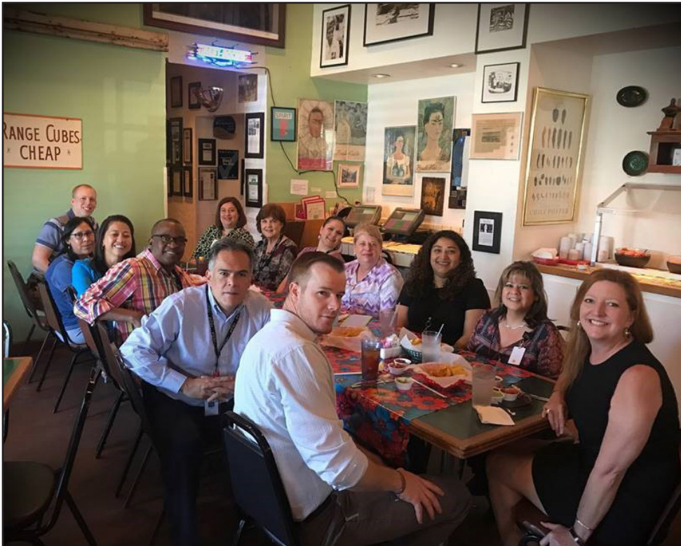
Corporate Accounting Team's day out