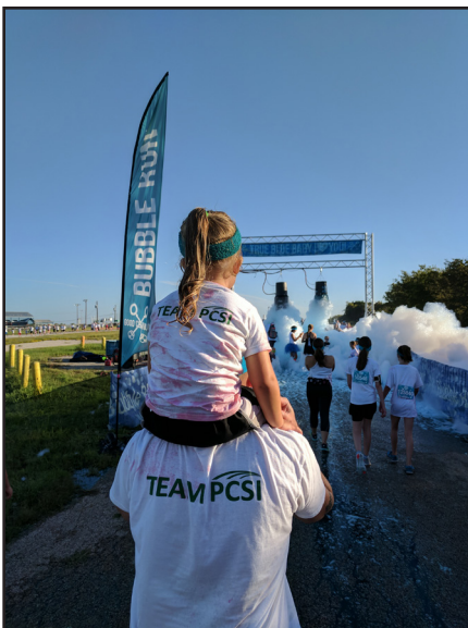
Team PCSI preparing for the next bubble fogger mid-race

PCSI was a first time sponsor for the Sammy's House 2017 Eat Drink & Be Scary Ball, which took place on Saturday, October 14, 2017 at the Hilton Hotel. Sammy's House is a nonprofit agency that provides services for children with special needs. They operate a child development center, a respite care program, summer camp, and family support services to fill the gaps in services for children, especially those who are medically fragile and/or developmentally delayed in Austin, TX and surrounding areas. Their high quality care is loving and nurturing, set in an inclusive environment where children can safely grow and learn to the best of their abilities. This fundraiser was a Halloween costume party and included dinner, live entertainment, costume contests, and optional live and silent auctions. Six PCSI representatives participated in the fun festivities.