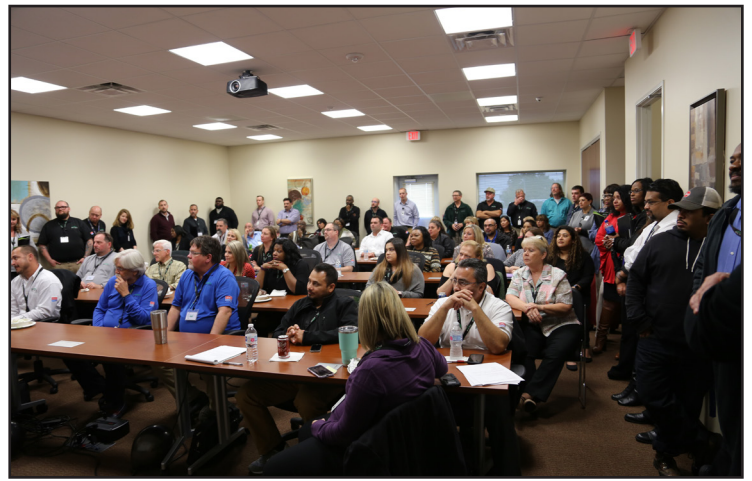
Intent listeners at the final training breakout