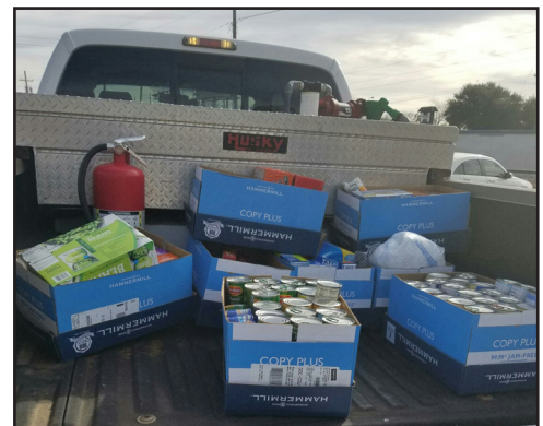
The impressive truck load donated by team 730!