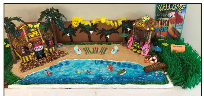
Beautiful cake made by Fort Hood staff highlighting PCSI and Vet Pride