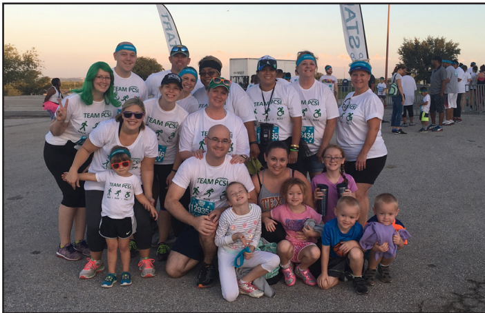
One of the three PCSI groups posing at sun rise