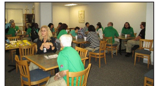
All three shifts at Site 720 filled the office with laughter

On November 27, 2017 Team 720 enjoyed their annual Thanksgiving potluck. All three shifts attended and the employees brought in plentiful amounts of unique food ranging from traditional ham and mashed potatoes to kimchi. Everyone had a great time eating and visiting together.