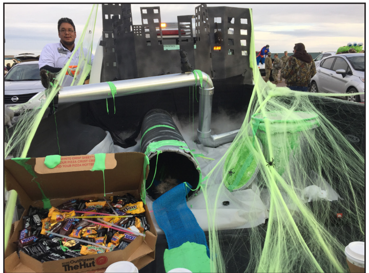
PCSI's sewer truck decor