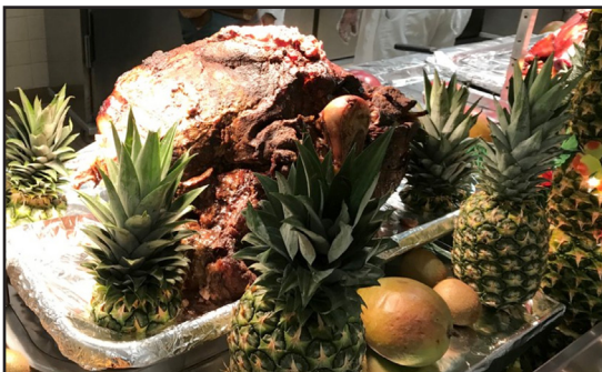
One of the delicious creations from Fort Hood staff