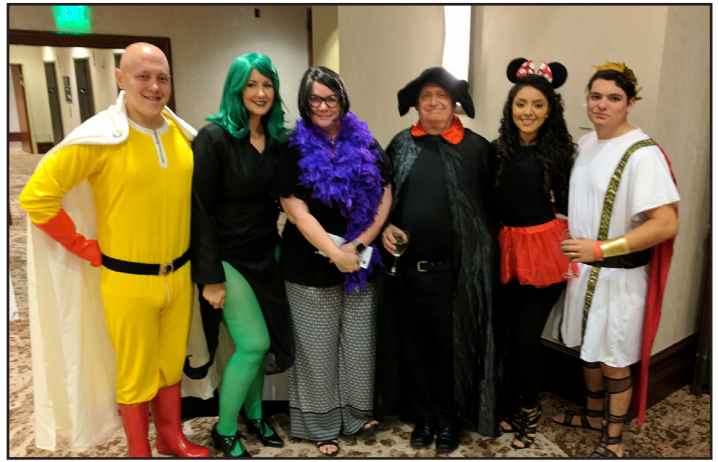
Corporate employees and their dates about to check out the auction