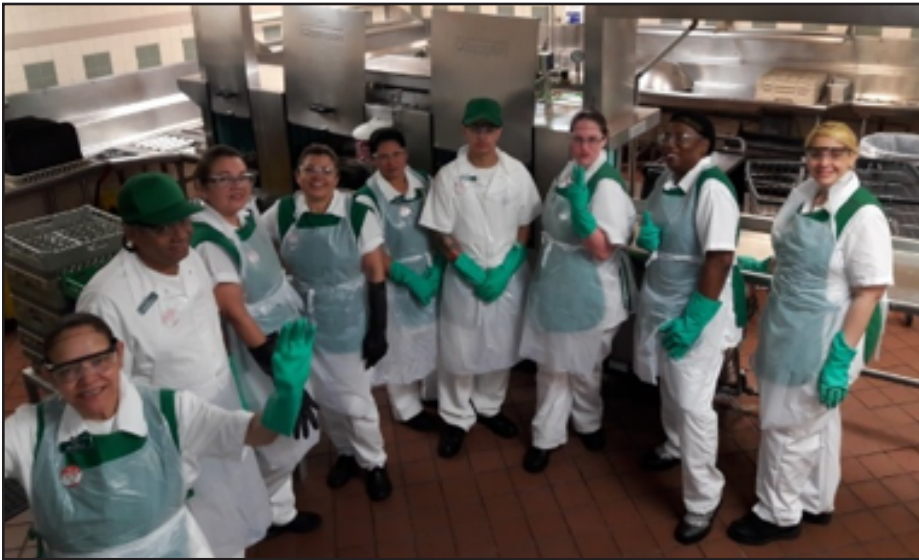
Fort Hood Food Service Team