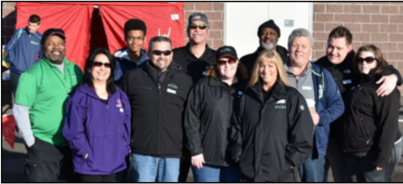
JBLM Team #1