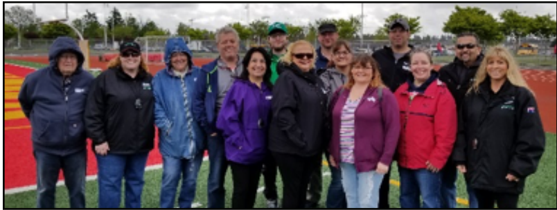
JBLM Team #2