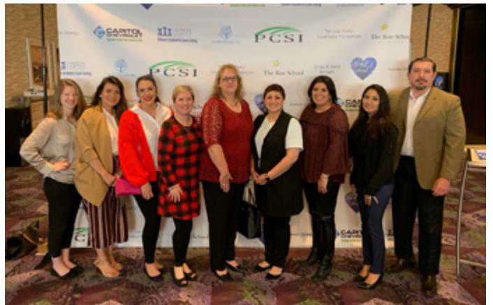
On February 15, PCSI was proud to serve as one of the sponsors of "Heart & Soul," The Rise School of Austin's 12th Annual Fashion Luncheon. PCSI Headquarters Team.