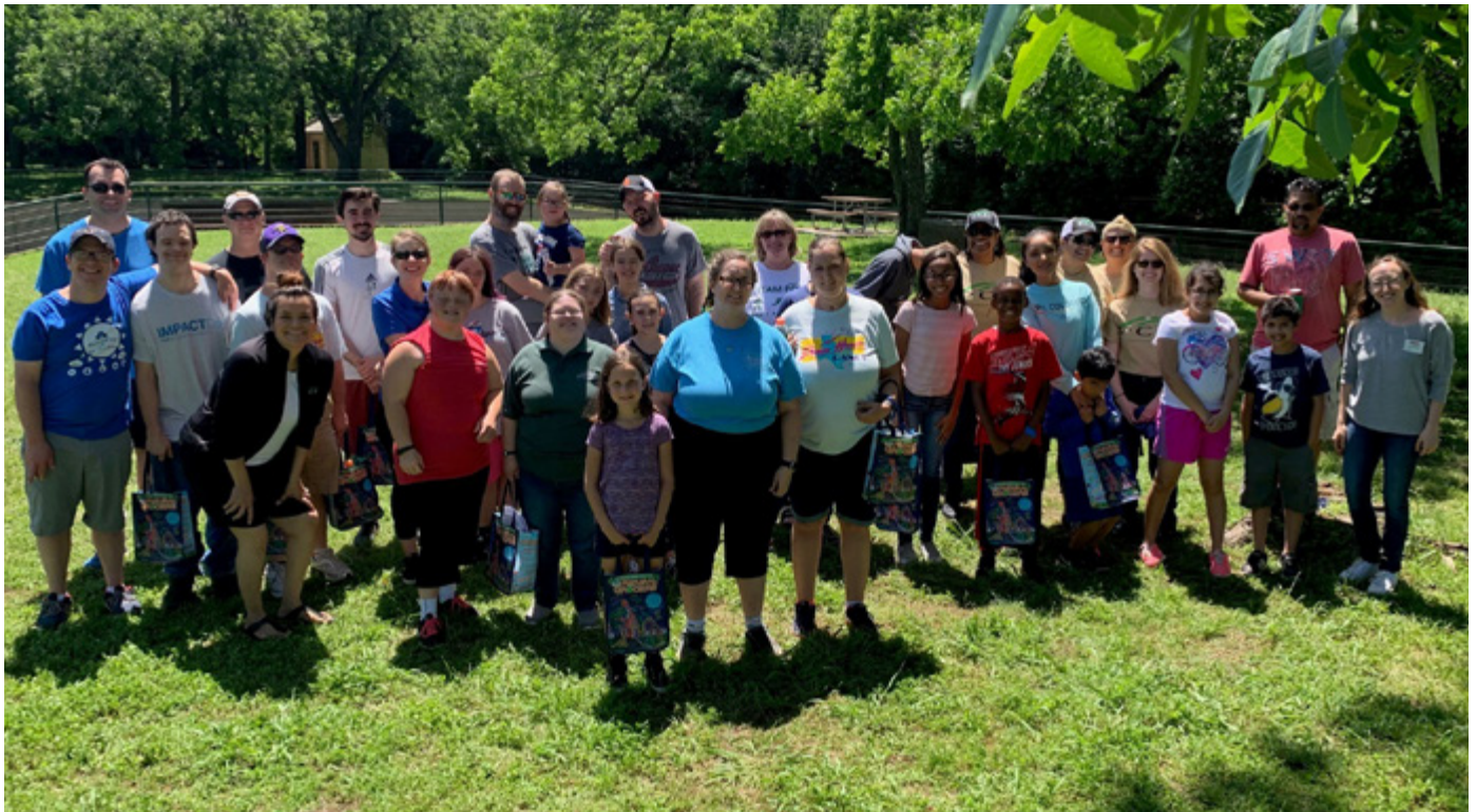
Group shot of more than 30 participants who engaged in the afternoon activities.