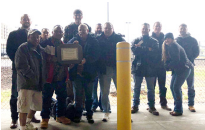
On May 15, due to their hard work and dedication to promote a positive safety culture, the PCSI grounds team at Schriever AFB celebrated seven years of no injuries. Congratulations and thank you for your hard work!