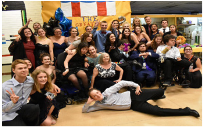
Tumwater High School Students

On Friday evening, May 31 from 7:00 pm to 9:30 pm, nine PCSI-JBLM employees and family members volunteered to chaperone the Thurston County School District’s “Life Skills Prom” for special needs students for the third year in a row. The “Greatest Prom Ever” themed after movie “The Greatest Showman”, had over 200 students in attendance. Each PCSI-JBLM volunteer had a job including handing out beads and glow sticks, refreshments, staffing the photo booth, and assisting with the corn hole game. Parents, teachers, Tumwater High students, and PCSI-JBLM volunteers came early to assist with setting up decorations and refreshments. As the students arrived, they were greeted by the Capital Lakefair Court. The students danced their hearts out, only taking short breaks for refreshments and photo booth opportunities. PCSI, JBLM volunteers mingled and danced with several of the students. The event was a huge success thanks to the donation from PCSI, and due to our volunteers, that provided support. The coordinator of