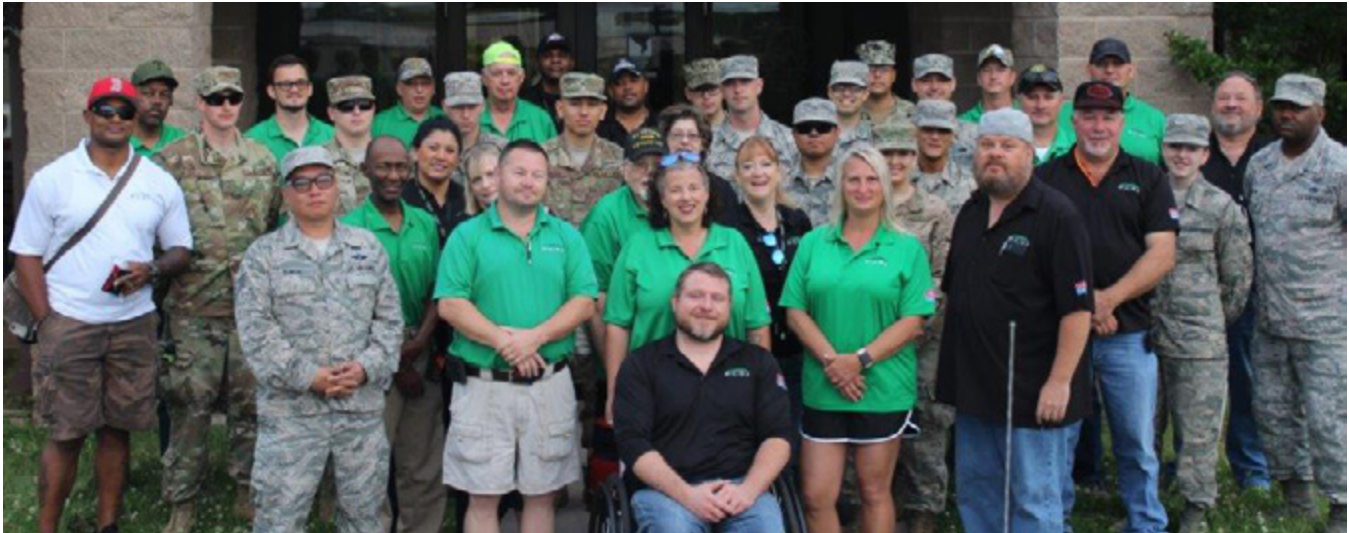
Tinker team including drivers and drivers who pitched in from other locations.

school district supplied 15 buses with drivers and Choctaw/Nicoma Park School District supplied 10 buses and drivers. The NAVY and the 72d LRS also loaned us drivers and bus stop attendants. The most impressive people were the PCSI drivers who worked two long days loading and driving buses. It takes lots of people to execute a plan such as transportation!