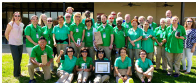
On April 10, PCSI Team at Ireland Army Health Clinic in Kentucky, celebrated one year of injury-free work with steak and lobster. Congratulations!