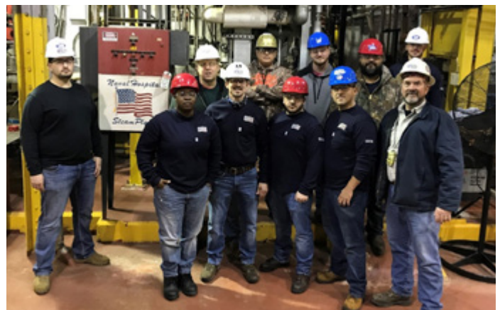
TEAM 700 – UA-VIP

The latest field trip was held on January 18, 2019. This is