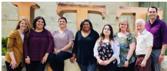
On April 17, our PCSI Austin and San Antonio rehab team went on a learning trip to the Witte Museum to visit "My Heart Is Not Blind," an exhibit sharing portraits and stories told by visually impaired people. It was an amazing experience.