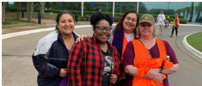
On April 6, members from our PCSI team volunteered at the 25th Annual Rosedale Ride benefiting the Rosedale School, AISD's only school for children with multiple disabilities.