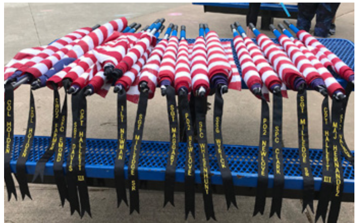
Flags of fallen soldiers

On May 25, the JBLM crew consisting of 15 employees and family members sponsored the Wear Blue: Run to Remember, Gold Star Youth Run. The youth who participate are all children between the ages of 6-16 of fallen soldiers who have been placed with active duty Military Mentors for 10 weeks of training. Wear Blue: Run to Remember is a national nonprofit running community that honors the service and sacrifice of the American military. PCSI provides a Continental breakfast for all the participants along with PCSI swag and information about our company. First thing in the morning, everyone participated in a Circle of Remembrance honoring 80 soldiers who have fallen on Memorial weekend. Participants proceeded to recite a soldier’s name in acknowledgement, followed by an acknowledgment identifying who everyone in attendance was running in honor of that day. Janet Smith, Project Manager of JBLM describes the event as “a blessing to be a part of and filled with emotion.” JBLM is proud to have had 4