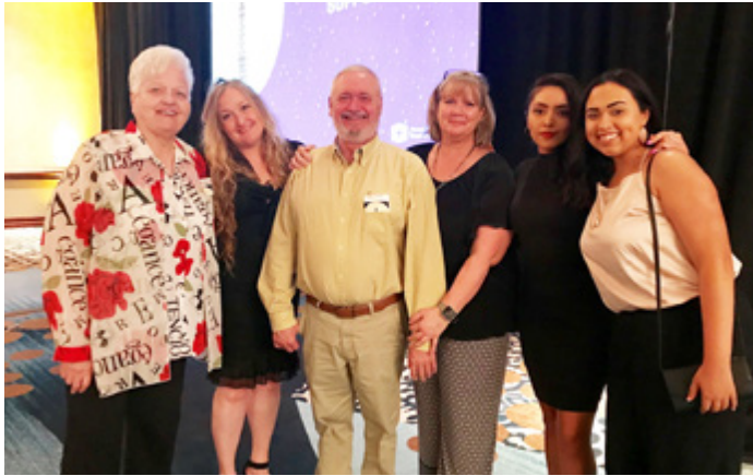
On May 24, PCSI Team at Headquarters Attends the Texas School for the Deaf Foundation's 13th Annual Diamond Gala: "Midnight in Paris"