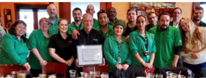
On May 14, due to their hard work and dedication to promote a positive safety culture, the PCSI custodial team at Schriever AFB celebrated two years of no injuries. Congratulations to the entire team!