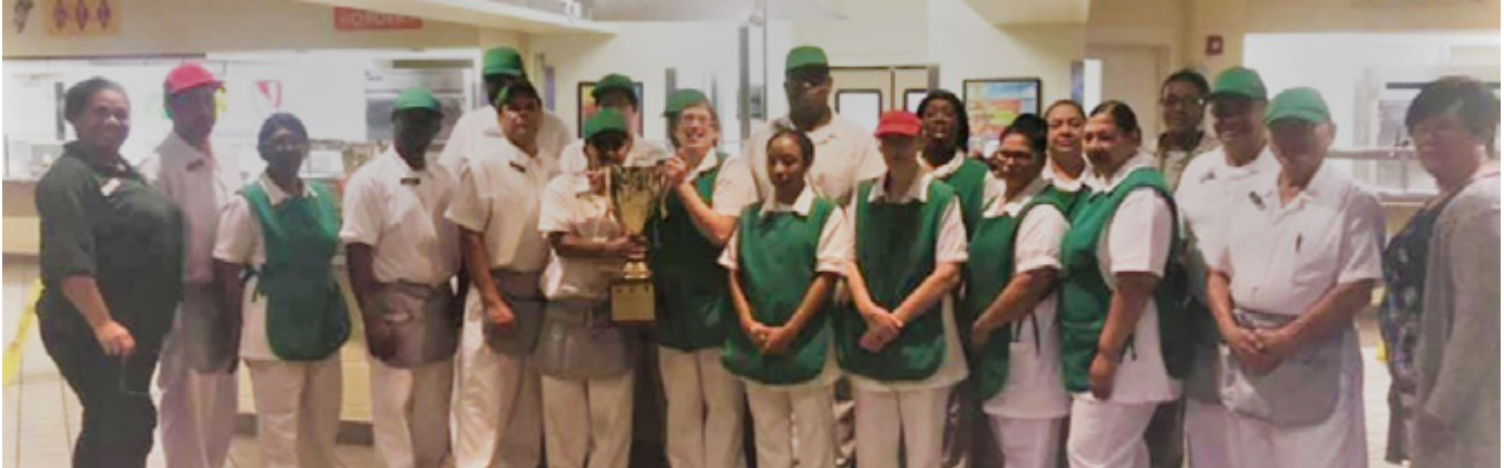
Pictured are our Dining Facility Attendants with the regional level cup on 5 February.

The Theodore Roosevelt Dining Facility staff on Fort Hood competed in the Department of the Army level Philip A. Connelly Award Program in February. Previously, they were winners at the regional level beating out staffs from Fort Hood, Fort Knox, Fort Leonard Wood, Fort Sill and Fort Carson. The Connelly awards recognize excellence in food service. The Department of the Army level represents the pinnacle.