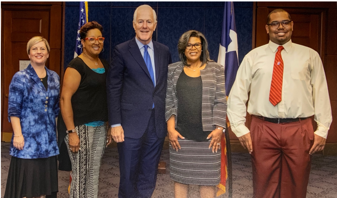
Team PCSI Meets U.S. Senator John Cornyn (TX)