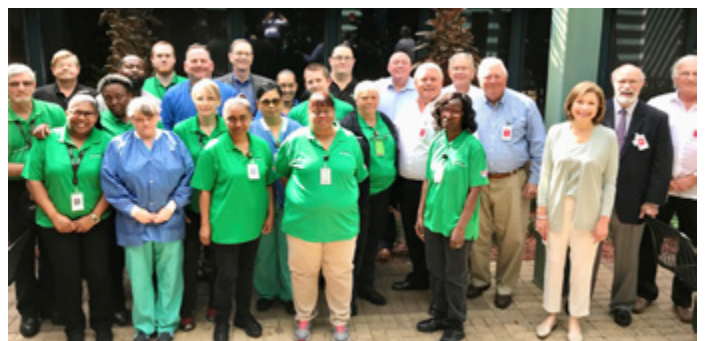
On April 25, PCSI Board of Directors, leadership and employees at Winn Army Hospital in Ft. Stewart, Georgia convened and embarked on a tour of the facilities. Go team!