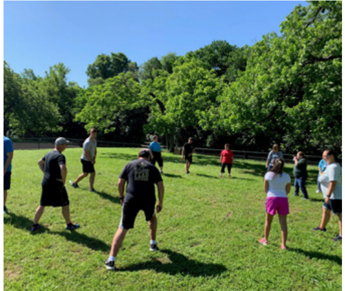
Event participants warming up for the day’s activities.

PCSI’s corporate office looks forward to hosting more events like this in the future.