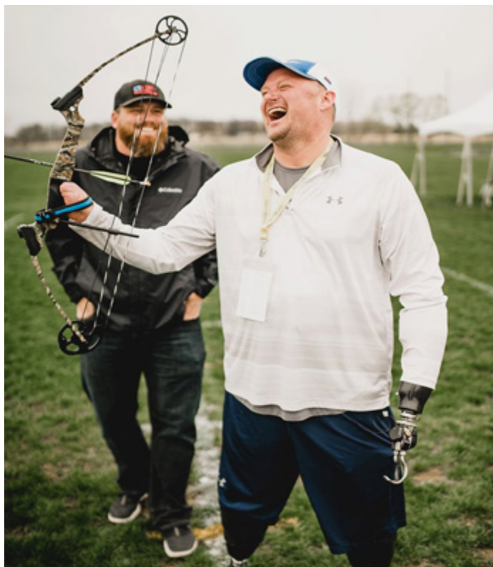
The PCSI Tinker Team was proud to once again volunteer, serve as a sponsor and participate in the Endeavor Games this year!