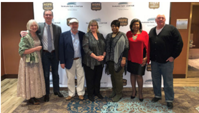
On March 2, our headquarters team was honored to sponsor and attend the 2nd Annual Samaritan Center's Veterans Ball in Austin, TX. The event was held to honor Veterans for their sacrifices and service to our country.