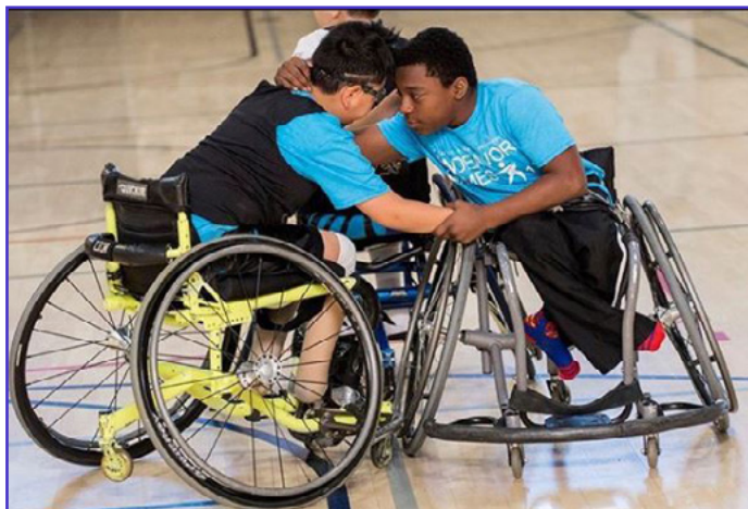
Endeavor Games Participants

PCSI has sponsored the University of Central Oklahoma (UCO) Endeavor Games in Edmond, Oklahoma for the past nine years. In its 20th year, The UCO Endeavor Games have proven to be successful in providing a high standard of competition where Paralympic and novice athletes can compete together at the same time in the same venue. For the past several years, it has been one of the largest multi-sport, multi-physical difference competitions in the nation. In 2014, the UCO Endeavor Games were awarded the Rings of Gold award from the United States Olympic Committee. That same year, talks were had about offering the Endeavor Games in more communities as it had become evident that there was a growing need for a cohesive regional and national event system. In 2017, The Turnstone Endeavor Games in Fort Wayne, Indiana were added with hopes to grow in cities across the nation. The events include wheelchair basketball, sitting volleyball, swimming, cycling, archery, shooting, track and field, power lifting and other sports. Tinker has proudly