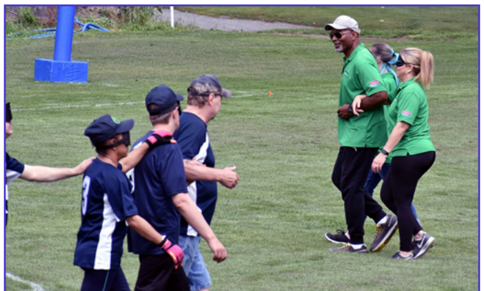
Teams Changing Positions on the field.